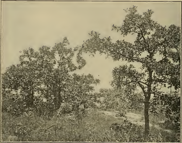
FIG. 2. Pioneer tree stage along crest of West Rock ridge, New Haven. Between the scattered trees ( Quercus stellata ) occur patches of herbaceous vegetation and shrubs. In the foreground is seen Helianthus divaricatus . The shrubs shown are Rhus typhina .

into one. Both the red cedar and the post oak require plenty of sunlight, i. e. , they are intolerant of shade. They never give rise to dense woodlands, but always form open, almost park-like groves (fig. 2). In the sunny patches between the trees the herbaceous and shrubby vegetation of the two preceding stages persists almost unaltered, but in shaded spots there begin to appear forms which are characteristic of the subsequent stage in the succession.